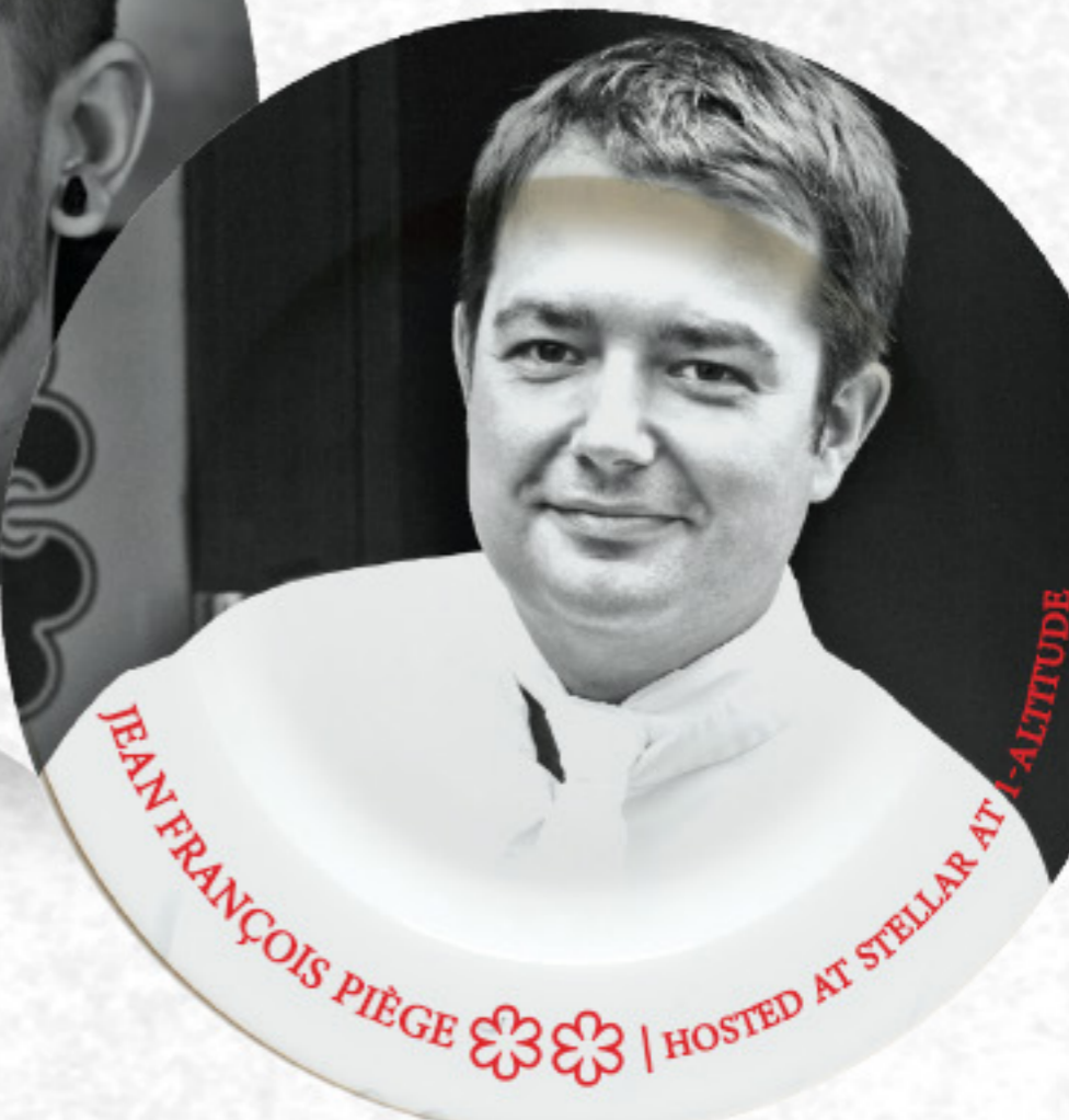
JEAN-FRANÇOIS PIÈGE | HOSTED AT STELLAR AT ALTITUDE