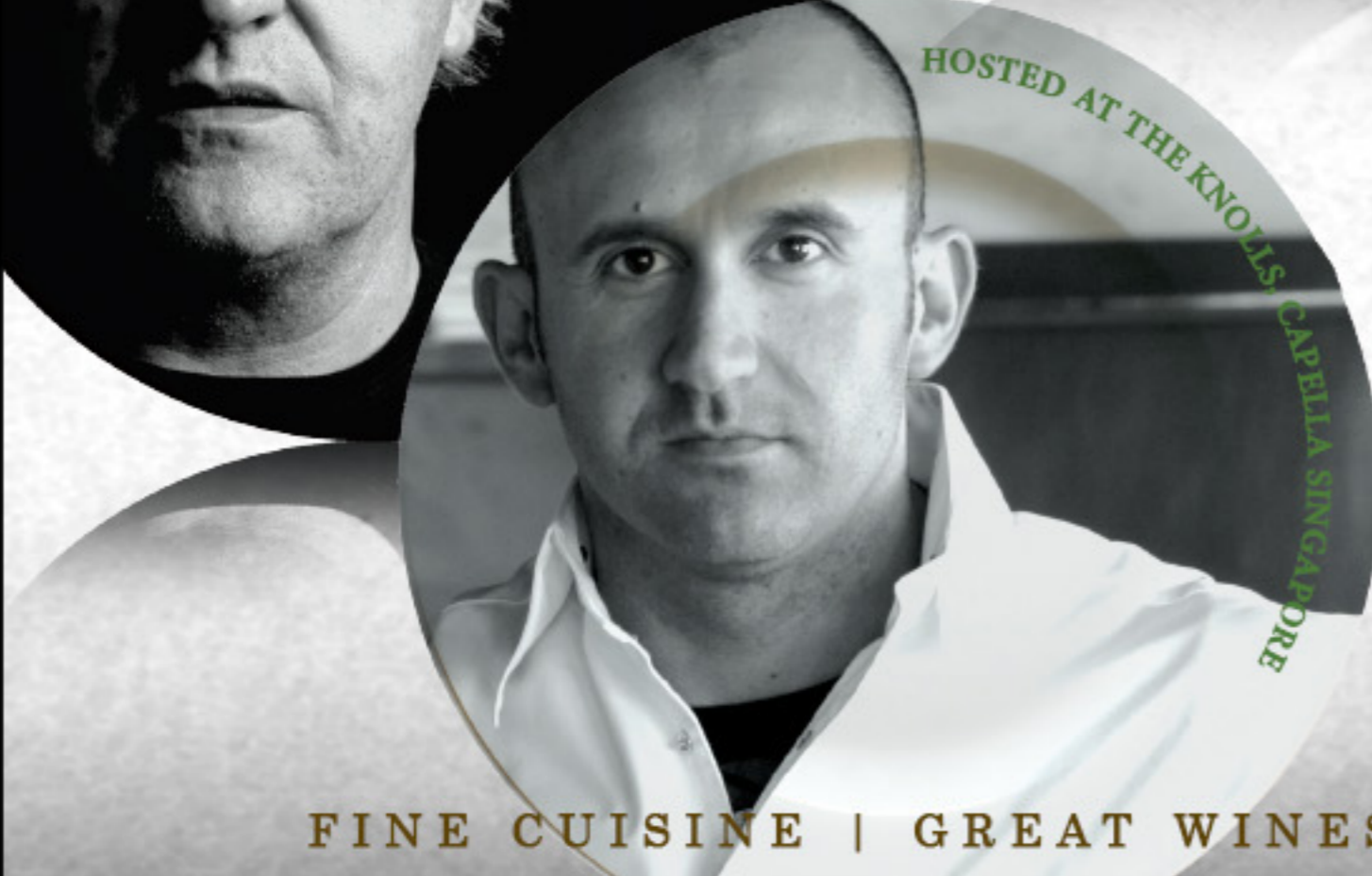
HOSTED AT THE KNOLL, CAPELLA SINGAPORE

FINE CUISINE | GREAT WINES | UNIQUE DINING